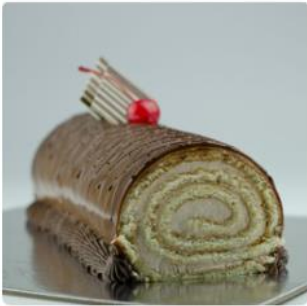
HAZELNUT SWISS ROLL CAKE 0.7 KG