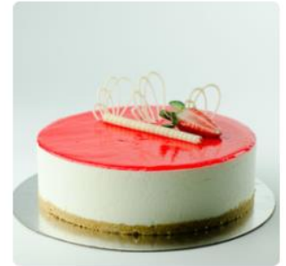
STRAWBERRY CHEESE CAKE 1 KG