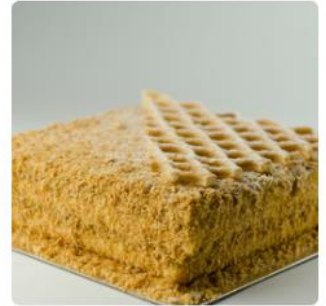
MILLEFEUILLE CAKE 1 KG