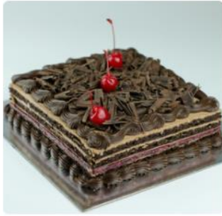
BLACK FOREST CAKE 1 KG