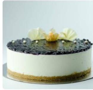
BLUEBERRY CHEESE CAKE 1 KG