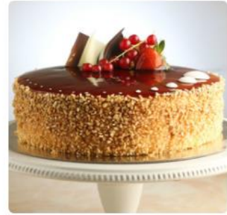
CARAMEL CAKE 1 KG