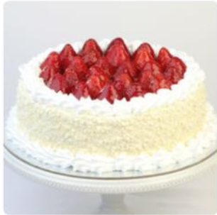
STRAWBERRY VANILLA CAKE 1 KG