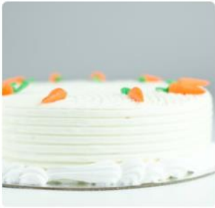
CARROT CAKE 1 KG