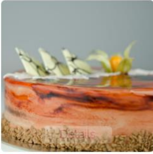
CHOCOLATE SPONGE CAKE WITH JELLY 1KG