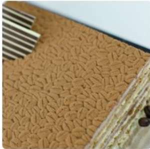
ROYAL CHOCOLATE CAKE 1 KG