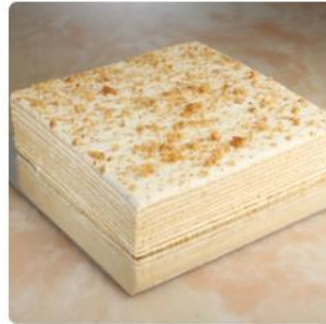
SOUR CREAM CAKE 1 KG