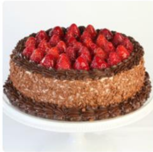
STRAWBERRY CHOCOLATE CAKE 1 KG