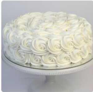
ROSE CAKE WITH WHITE GANACHE 1 KG