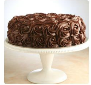
ROSE CAKE WITH CHOCOLATE GANACHE 1 KG