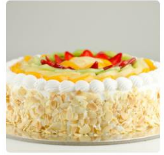
FRUIT CAKE 1 KG