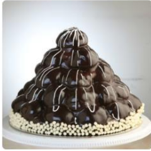
PROFITEROLE CAKE 1 KG