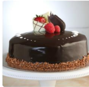
CHOCOLATE FUDGE CAKE 1 KG