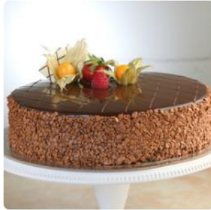
HONEY CHOCOLATE CAKE 1 KG