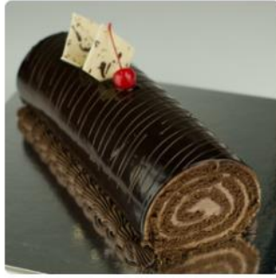
CHOCOLATE SWISS ROLL CAKE 0.7 KG