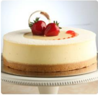
BAKED CHEESE CAKE 1 KG