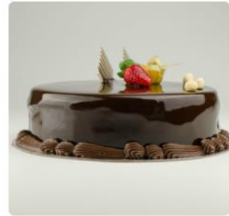
CHOCOLATE HAZELNUT CAKE 1 KG