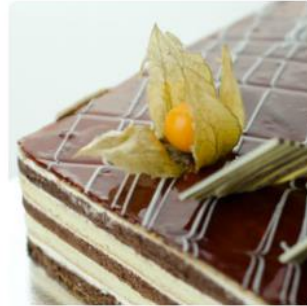
MARBLE CAKE 1 KG