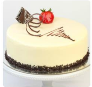
VANILLA SPONGE CAKE 1 KG