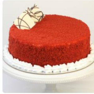
RED VELVET CAKE 1 KG