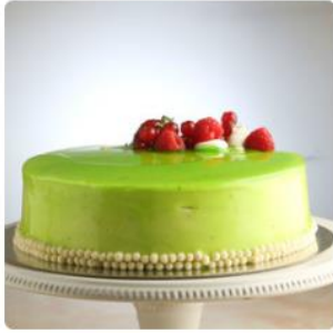
PISTACHIO CAKE 1 KG