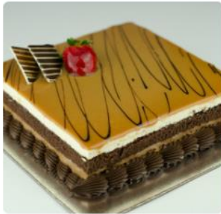
CHOCOLATE CARAMEL CAKE 1 KG